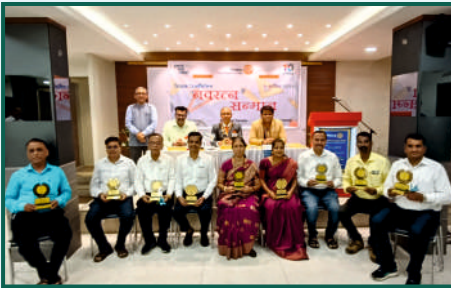
The Regular Meeting of Rotary Club of Dombivli Winners was held on 9th September 2025 at Shubham Banquets, Dombivli East