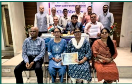
The regular meeting of Rotary Club of Dombivli Winners was held on 23rd September 2025 at Shubham Banquets, Dombivli East